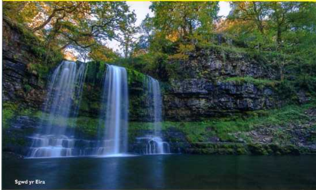
Sgwd yr Eira