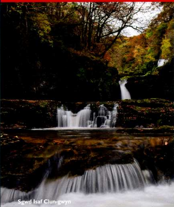
Sgwd Isaf Clun-gwyn