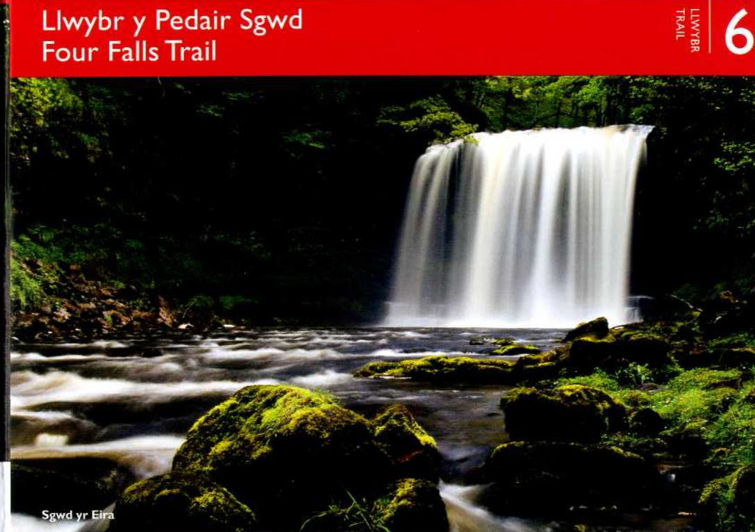
Sgwd yr Eira

Gallwch ymuno â'r Llwybr hwn o'r maes parcio talu ac arddangos yng Nghwm Porth hefyd, ble ceir Pwynt Gwybodaeth wedi'i staffio a chyfleusterau tŷ bach. Ceir mynediad i'r maes parcio poblogaidd hwn ar hyd ffordd gul iawn – dewch yma'n gynnar i sicrhau eich lle!